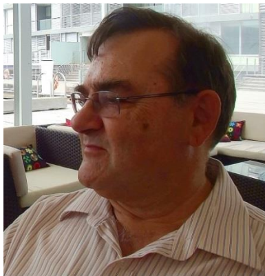
LEN SORBELLO MEMORIAL

TROPHY (Best current vintage or one year old semillon) 2014 Briar Ridge Dairy Hill Hunter Valley Semillon ($35.00)