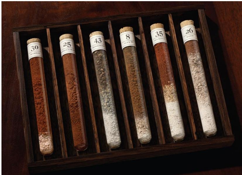
Single vineyard soil profiles

2001 Harold Cabernet Sauvignon Mature colour but holding its red. Shows its age but also ripe fruit. It doesn't exactly scream cabernet on the nose. Definitely ready. Recommended